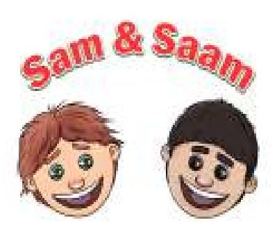
Chit Chat 2 – I have, you have